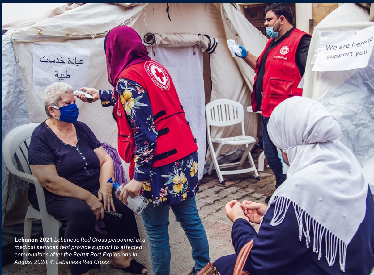
Lebanon 2021 Lebanese Red Cross personnel at a medical services tent provide support to affected communities after the Beirut Port Explosions in August 2020.

The IFRC joined the project in February 2021 to perform oversight and supervision ( IFRC, 2021 ). IFRC's role was to monitor multiple aspects of the rollout, from supply chain management tasks like temperature maintenance to service delivery at vaccination sites, eligibility of vaccine recipients, and capturing client perspectives and feedback.