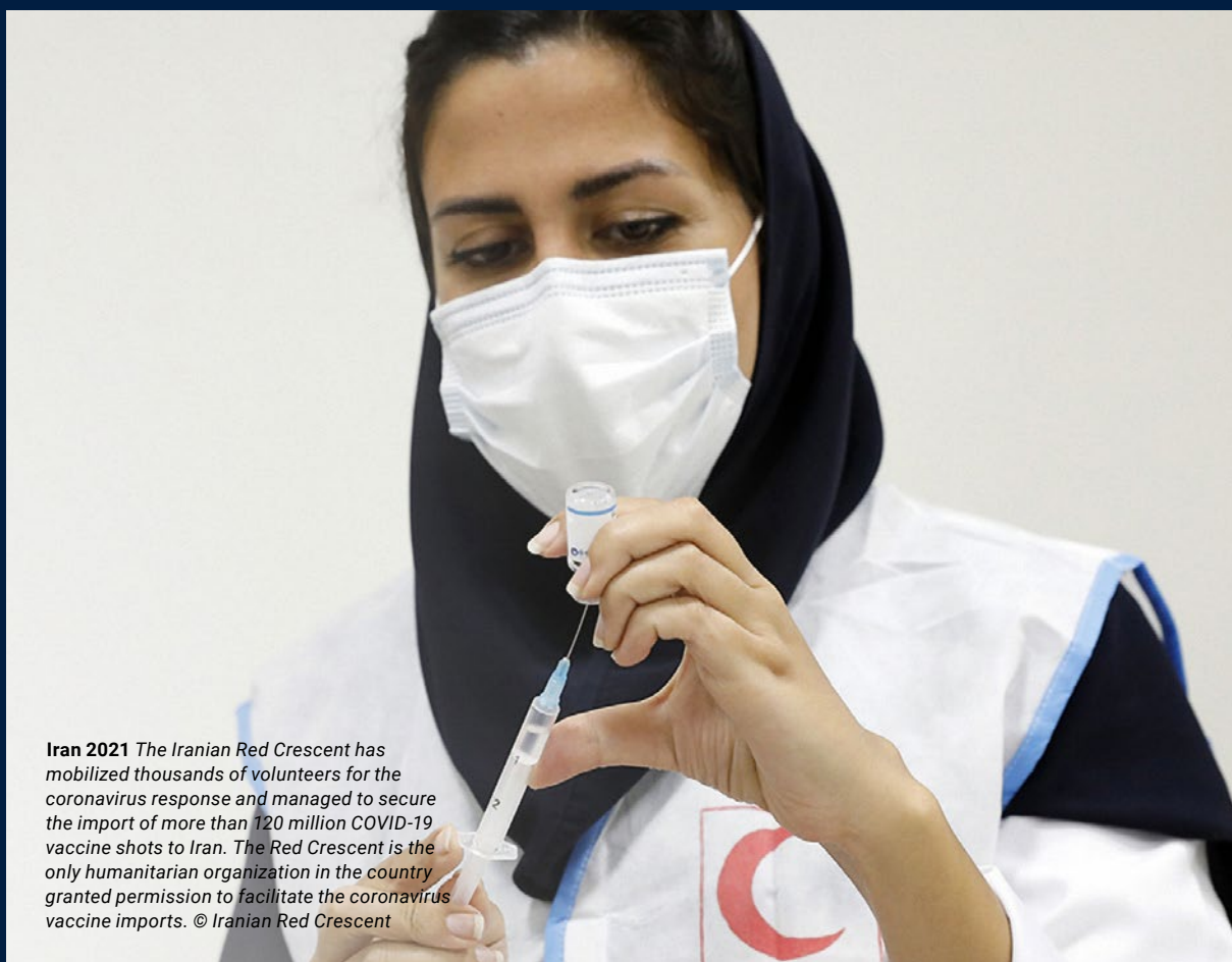
Iran 2021 The Iranian Red Crescent has mobilized thousands of volunteers for the coronavirus response and managed to secure the import of more than 120 million COVID-19 vaccine shots to Iran. The Red Crescent is the only humanitarian organization in the country granted permission to facilitate the coronavirus vaccine imports.

The Iranian Red Crescent Society is running 10 field hospitals and 173 immunization centres launched in conjunction with Iran's Ministry of Health. All these centres are involved in COVID-19 vaccination efforts. Crucially, The Iranian Red Crescent Society has been mandated to facilitate vaccinations of three to four million refugees in the country (subject to vaccine availability).