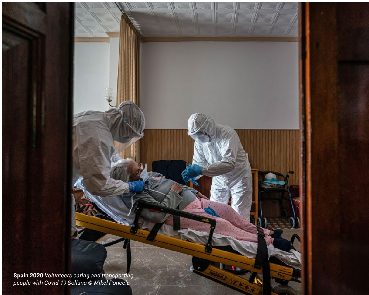
Spain 2020 Volunteers caring and transporting people with Covid-19 Sollana

The result was a significant impact on health, livelihoods, economies and society. Ultimately, we cannot measure the final cost, as the virus continues to spread and evolve. It should be a truism that nobody is safe until everybody is safe. The failures of the international community mean that even now, over two years into the COVID-19 pandemic, nobody is safe. We cannot stop pushing for global solidarity: the COVID-19 pandemic is not over, and even if it was the risk of global health crises shows no sign of diminishing.