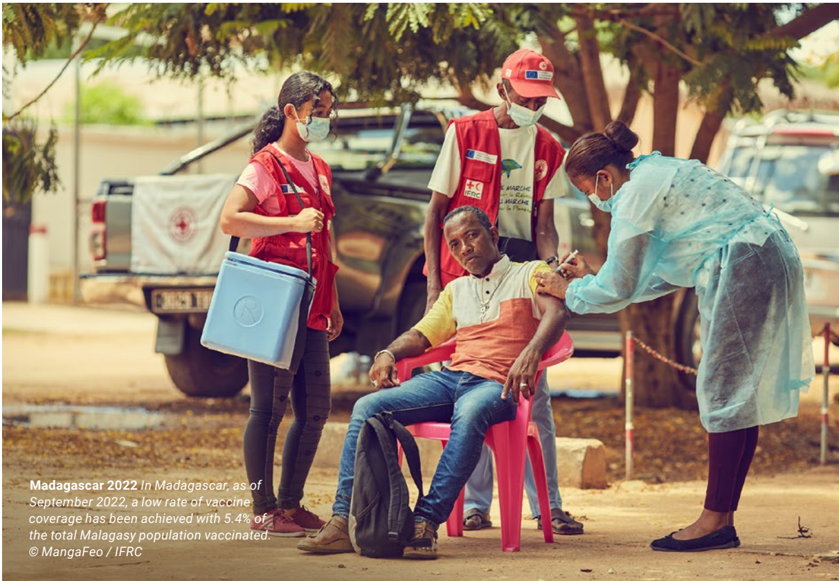
Madagascar 2022 In Madagascar, as of September 2022, a low rate of vaccine coverage has been achieved with 5.4% of the total Malagasy population vaccinated.

How has this enormous injustice occurred? The answer is complex, but a key contributor is a failure of solidarity: a combination of economic self-interest, lack of political courage and failure to take the pandemic's impacts sufficiently seriously. Another key contributor is lack of preparedness. Many of the mechanisms mentioned above were created only shortly before or well into the pandemic. This did not leave time for the creators to fully anticipate or address the extremely complex processes involved in the development, production, distribution and administration of pandemic response products like vaccines, therapeutics and diagnostics. In section 3.2 we explore what happened in more detail.