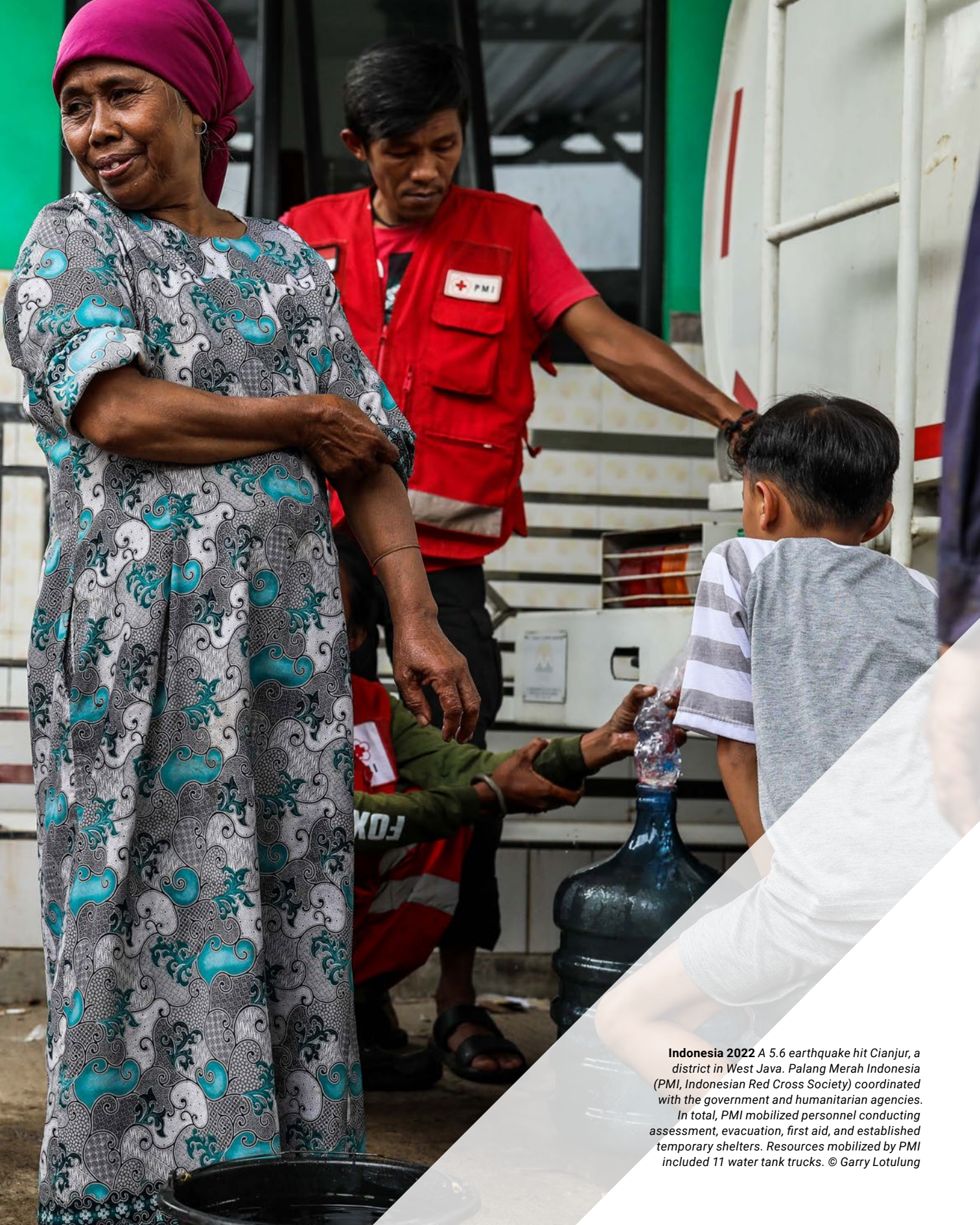
Indonesia 2022 A 5.6 earthquake hit Cianjur, a district in West Java. Palang Merah Indonesia (PMI, Indonesian Red Cross Society) coordinated with the government and humanitarian agencies. In total, PMI mobilized personnel conducting assessment, evacuation, first aid, and established temporary shelters. Resources mobilized by PMI included 11 water tank trucks.