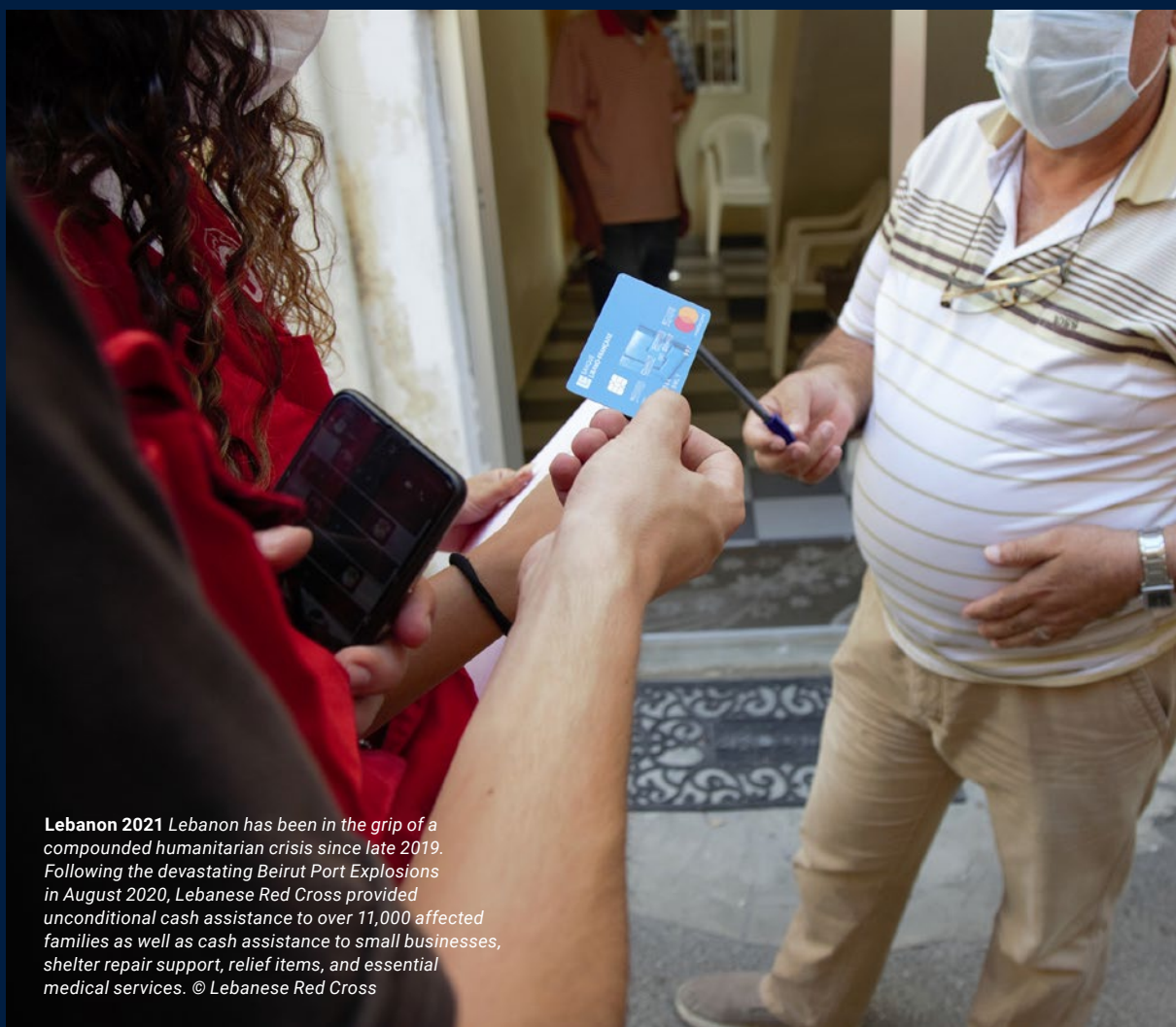
Lebanon 2021 Lebanon has been in the grip of a compounded humanitarian crisis since late 2019. Following the devastating Beirut Port Explosions in August 2020, Lebanese Red Cross provided unconditional cash assistance to over 11,000 affected families as well as cash assistance to small businesses, shelter repair support, relief items, and essential medical services.