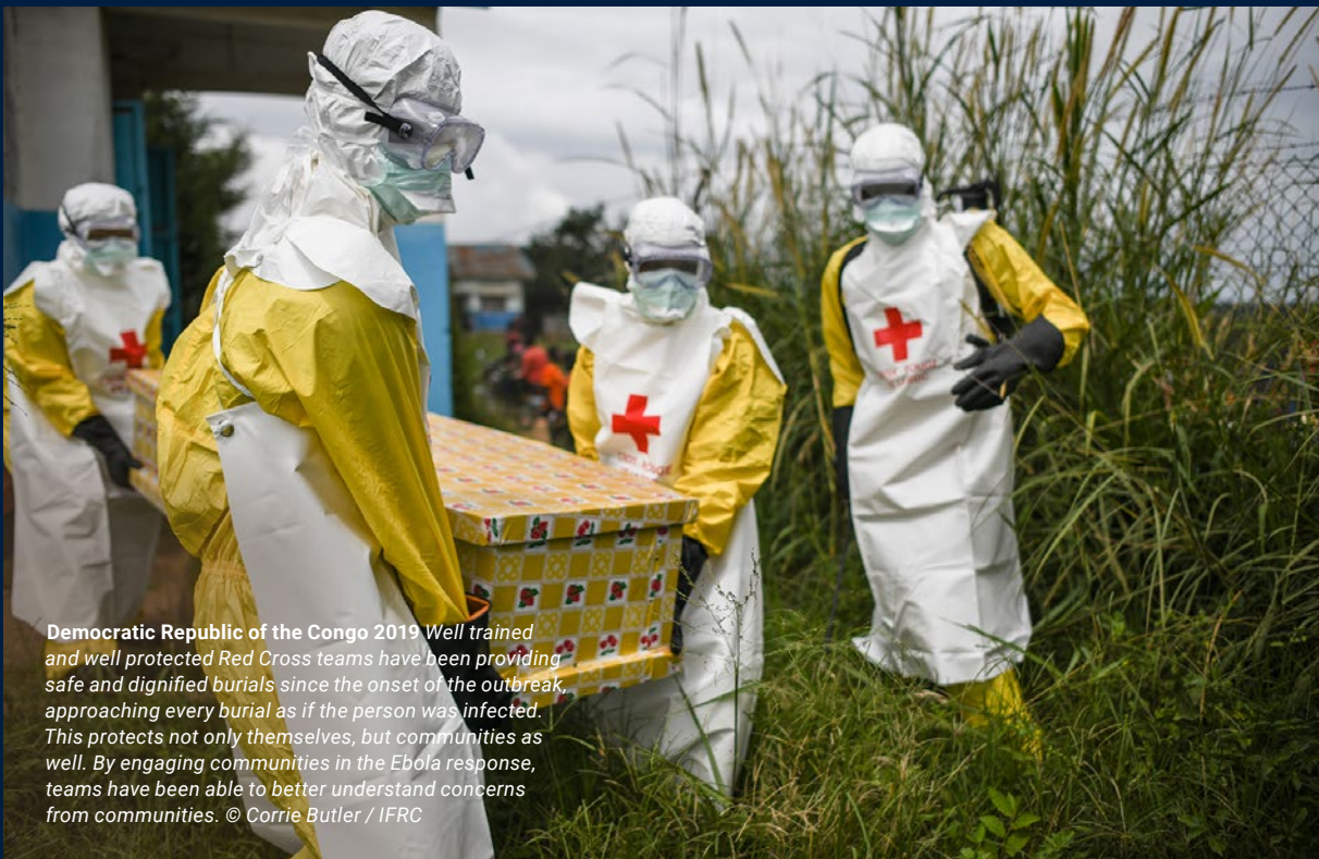
Democratic Republic of the Congo 2019 Well trained and well protected Red Cross teams have been providing safe and dignified burials since the onset of the outbreak, approaching every burial as if the person was infected. This protects not only themselves, but communities as well. By engaging communities in the Ebola response, teams have been able to better understand concerns from communities.

A study published in February 2022 demonstrated the value of this approach. During the outbreak, many communities wished to continue to honour their dead. This seemed to create a conflict because procedures for safe and dignified burials meant bodies were interred in sealed bags to reduce the risk of the disease spreading. However, compromises were found. In the North Kivu region it was important that family members could see the faces of the dead, so clear windows were added to the body bags. This allowed funeral rites to be honoured while maintaining health security, and it built a degree of trust ( McKay et al, 2022 ).